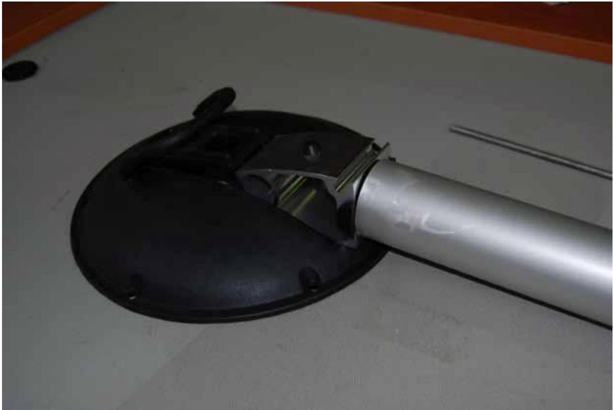
Position cylinder over the circular cap.