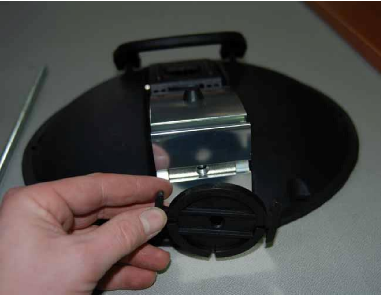
Position the circular cap