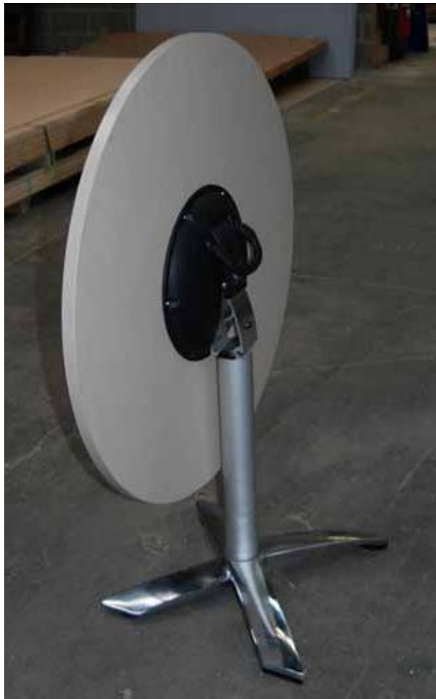
Your Reno flip top table is now ready to use