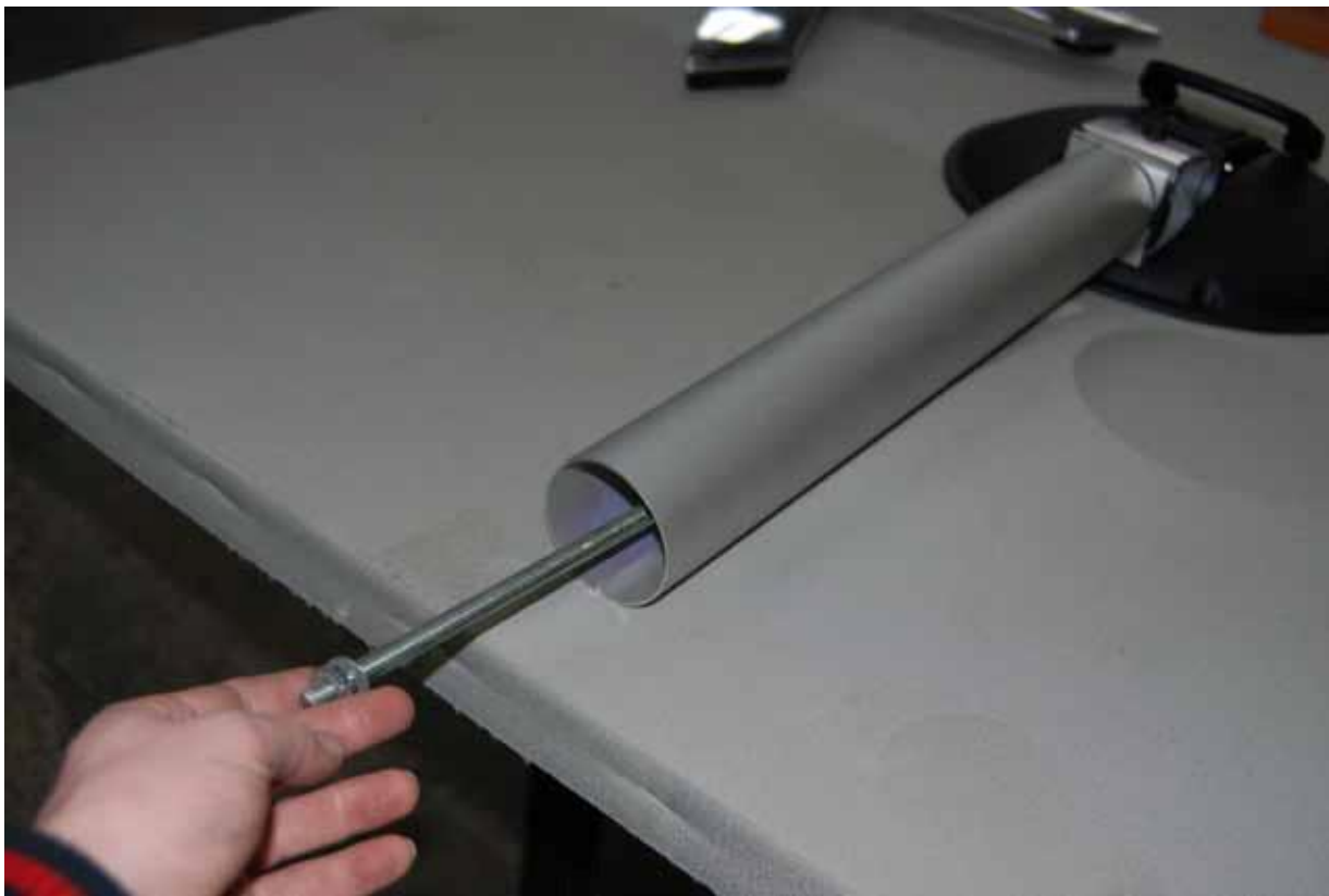
Position bolt through cylinder and thread this into the slotted the rectangle piece in the mechanism. This can be done up tightly by hand.