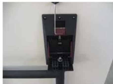
Eiffel table mechanism