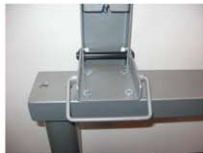
Unlocked mechanism above