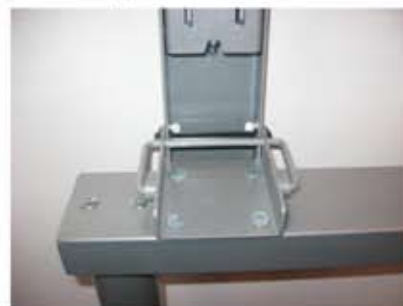
Locked mechanism above