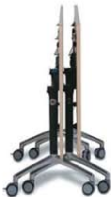
Space saving stacking