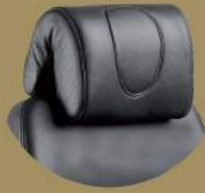
ACS Executive Headrest