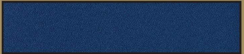
Costa Blue Cloth