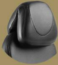
Aztec Headrest (Leather Only)