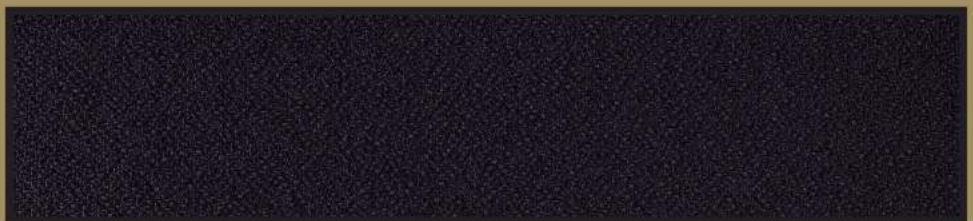
Havana Black Cloth