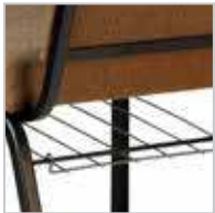
UNDER SEAT BOOK RACK