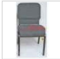
WIDER 550MM SEAT