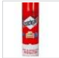
COMMERCIAL GRADE 3 STAGE SCOTCH GUARD APPLICATION